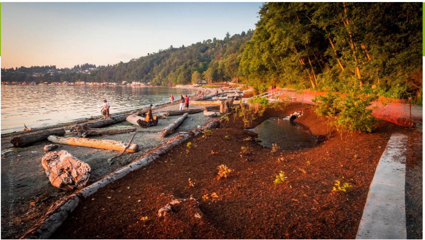
Partnering with local, state, and federal governments to remove bulkheads and restore shorelines.